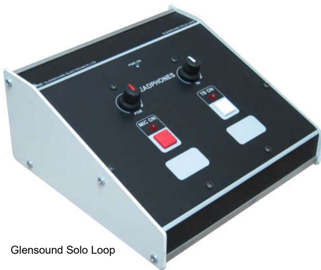
GlenSound Solo Loop