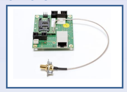
Web server - Web server + GSM