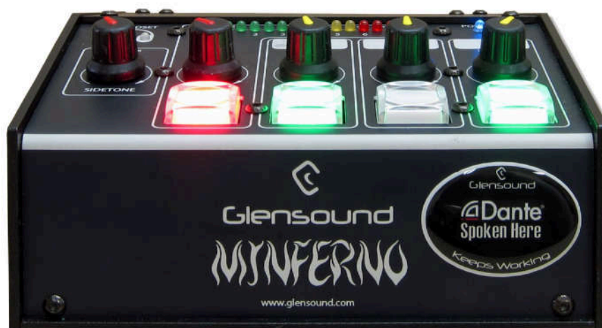
MinFerno/3 Commentator's Box