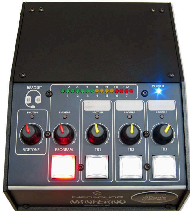
MinFerno/3 Commentator's Box