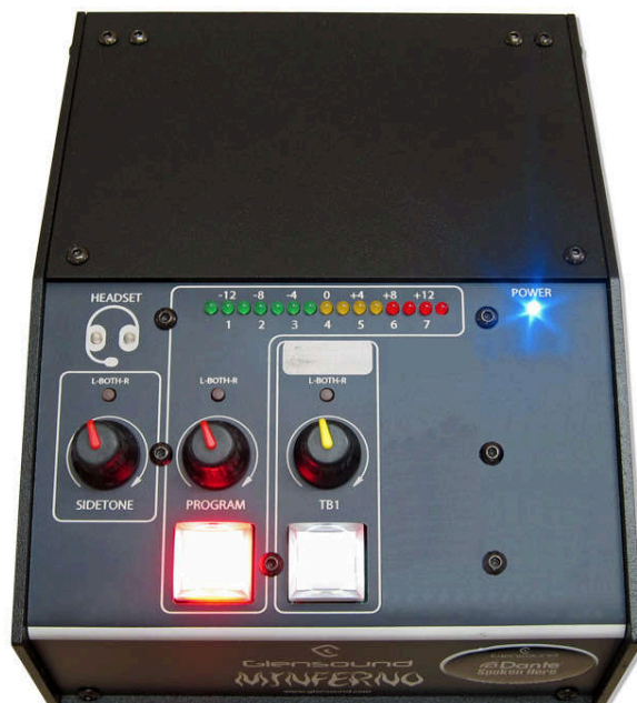
MinFerno/1 Commentator's Box