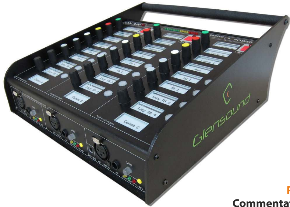
Paradiso Commentators Box