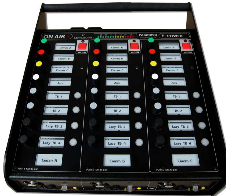
Paradiso Commentators Box