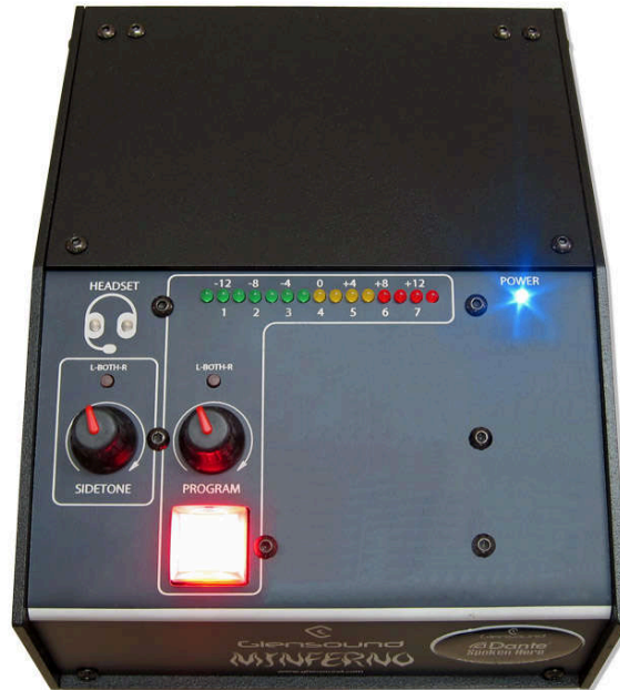
MinFerno/0 Commentator's Box