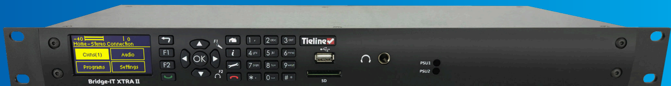
Bridge-IT XTRA II