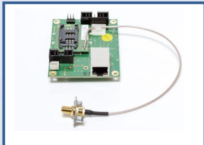
Web server – Web server + GSM